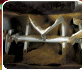
PATENTED "DOUBLE HELIX" SHREDDER & BLADE DESIGN

Our systems are available with processing capacities to fit every recycling requirement — from 66 lbs to over 100 tons per day.